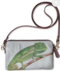
STATEMENT CLUTCH Artwork: Chameleon BY VEDA 45.00 USD