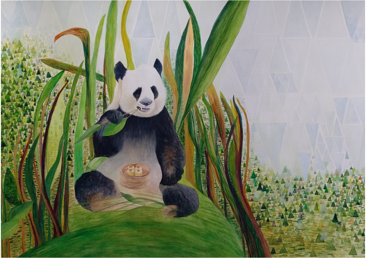
"Hungry panda", watercolour, Japanese paint and thread, 41 x 31 cm