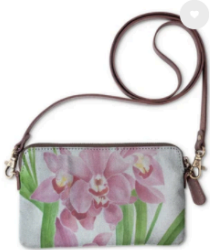
STATEMENT CLUTCH Artwork: Pink Orchid BY VEDA 45.00 USD