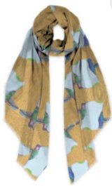
MODAL SCARF Artwork: Hummingbirds BY VEDA 45.00 USD