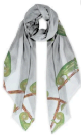
MODAL SCARF Artwork: Chameleon BY VEDA 50.00 USD