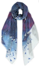
MODAL SCARF Artwork: Victoria Crowned Pigeon BY VEDA 50.00 USD