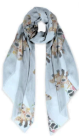
MODAL SCARF Artwork: Mr Giraffe BY VEDA 50.00 USD