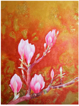
Pink Magnolia, 2017 Watercolour, acrylic, foil, gold leaf 31 x 41 cm