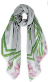
MODAL SCARF Artwork: Pink Orchid BY VEDA 50.00 USD