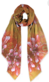
MODAL SCARF Artwork: Pink Magnolia BY VEDA 50.00 USD

(online) Vida Design Studio An on-going collaboration featuring a selection of animal & botanical printed accessories.